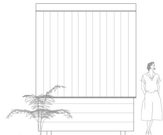
Alçado Lateral Direito