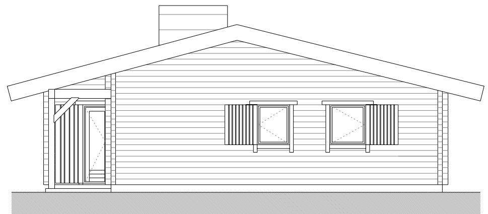
Alçado lateral direito